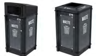
FRONT-LOAD SINGLE 36G

TOP-LOAD | 36 GALLON 22.5"D x 22"W x 38.5"H