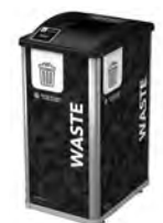
SINGLE | 32G