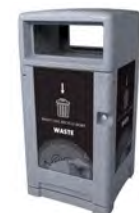
Greystone Outdoor Single