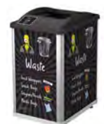
JUNIOR | 21G