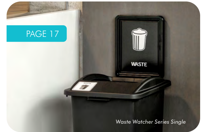
Waste Watcher Series Single