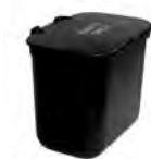
HANGING WASTE BASKET