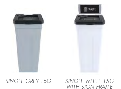
SINGLE GREY 15G

SINGLE | 15 GALLON 15.25"D x 13"W x 27.25"H