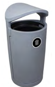
Single - Greystone

SINGLE | 36 GALLON 22.75"D x 22.875"W x 46"H