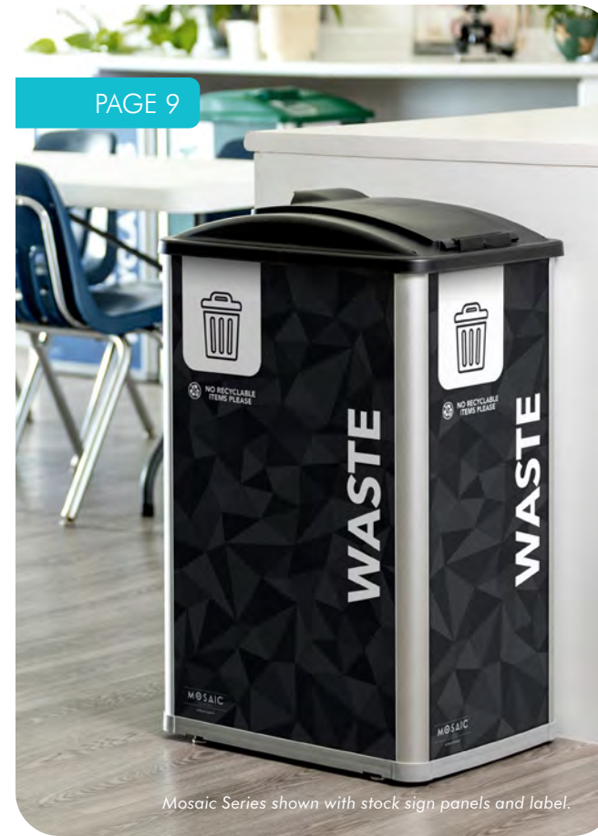
Mosaic Series shown with stock sign panels and label.