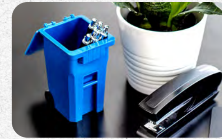
Mini Roll-Out Recycling Cart