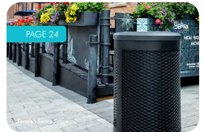
Toronto Series Single