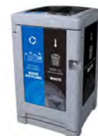
Greystone Indoor Double

DOUBLE | 40 GALLON 23.5"D x 23.5"W x 48"H