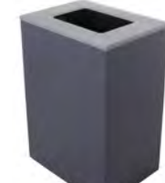
XL CUBE 32G

*Available with Ashtray, Full or Mixed Opening