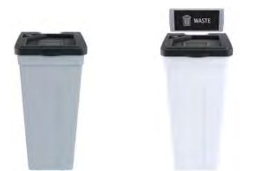
SINGLE GREY 15G

SINGLE | 15 GALLON 15.25"D x 13"W x 27.25"H