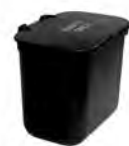
HANGING WASTE BASKET