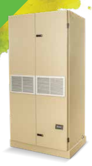
QH SERIES Heat Pumps

These more budget-friendly interior mounts boast many of Bard's best features. All maintenance and service can be performed inside the building, making multi-story installations simple. There's also a high-efficiency geothermal heating and cooling option.