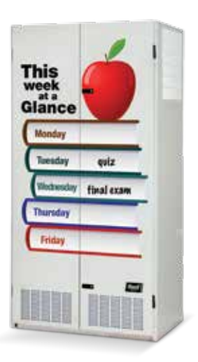
IA SERIES Air Conditioners