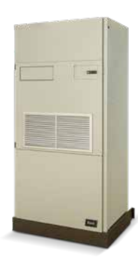
QWS SERIES Geothermal Heat Pumps

These more budget-friendly interior mounts boast many of Bard's best features. All maintenance and service can be performed inside the building, making multi-story installations simple. There's also a high-efficiency geothermal heating and cooling option.