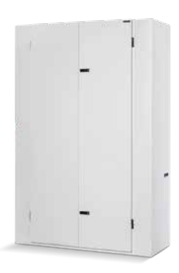
IZ SERIES Heat Pumps