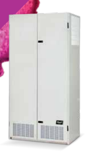
IH SERIES Heat Pumps

The I-TEC is an interior model that provides superior indoor air quality and the ultimate in quiet operation. Vented above the sill at window level, it's designed to blend in with exterior features.