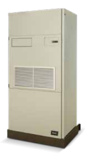
QC SERIES Chilled Water/Hot Water