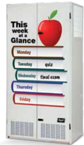
IA SERIES Air Conditioners