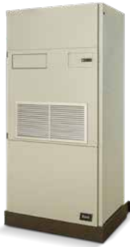
QWS SERIES Geothermal Heat Pumps