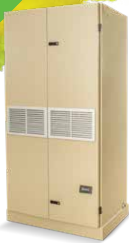
QH SERIES Heat Pumps

These more budget-friendly interior mounts boast many of Bard's best features. All maintenance and service can be performed inside the building, making multi-story installations simple. There's also a high-efficiency geothermal heating and cooling option.