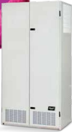
IH SERIES Heat Pumps

The I-TEC is an interior model that provides superior indoor air quality and the ultimate in quiet operation. Vented above the sill at window level, it's designed to blend in with exterior features.