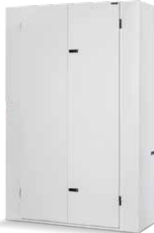
IZ SERIES Heat Pumps