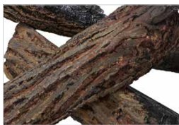
Rhythmic inner glow logs