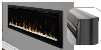
Ignite XL Trim Kit