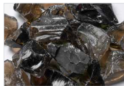
Black shattered glass