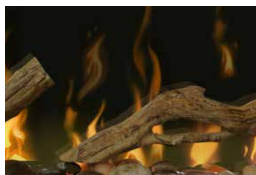
Driftwood and River Rock Ember Bed Kit