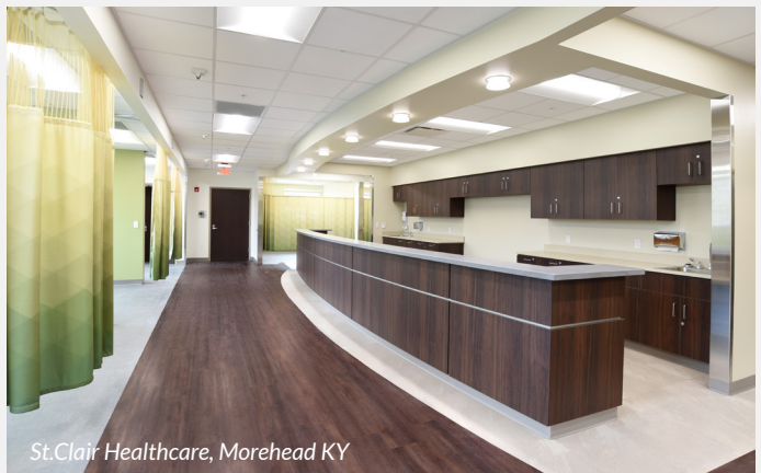
St. Clair Healthcare, Morehead KY