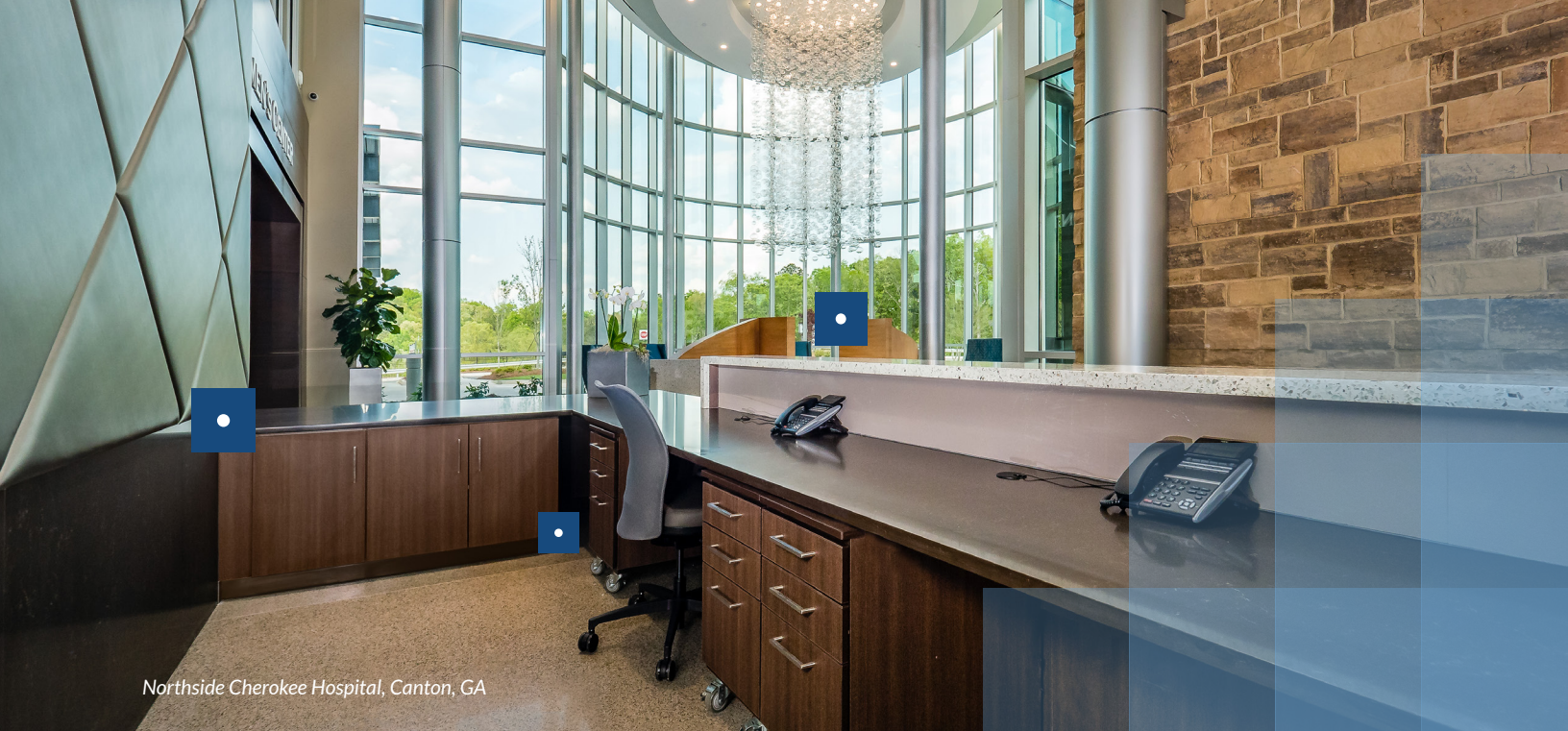
Northside Cherokee Hospital, Canton, GA