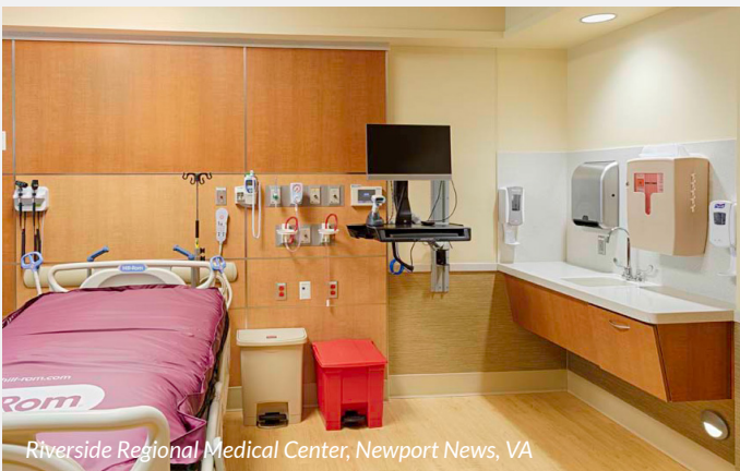
Riverside Regional Medical Center, Newport News, VA