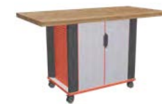
Mobile Maker Center - J850 with Shelf Storage & Doors

Multi-functional SALTO elements used in this STEM/STEAM setup: