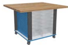
Mobile Maker Center - J8820 with Butcher Block & Tote Storage