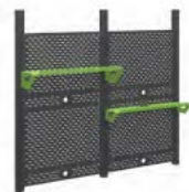
Wall-Mount Pegboard - WMP60 with 12" Shelf (SSH12)