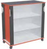
Mobile Storage - J000 with Shelves