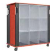
Mobile Storage - J1230 with Cubby Storage