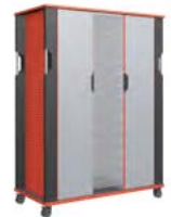
Mobile Storage - J1490 Shelf, Tote Storage & Door

Multi-functional SALTO elements used in this teacher area: