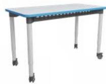
Multi-Purpose Table - MDT10 with Casters

3D Printer Cart shown with an optional pegboard.