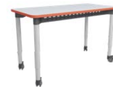
Multi-Purpose Table - MDT10 with Casters