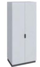
Tall Cabinet - T0100 with Shelf Storage & Doors