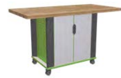
Mobile Workcenter - J8150 with Doors & Shelf Storage