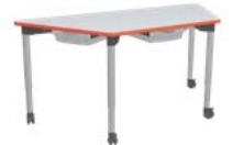
Trapezoid Multi-Purpose Table - MDT40 with Tote Drawer Storage