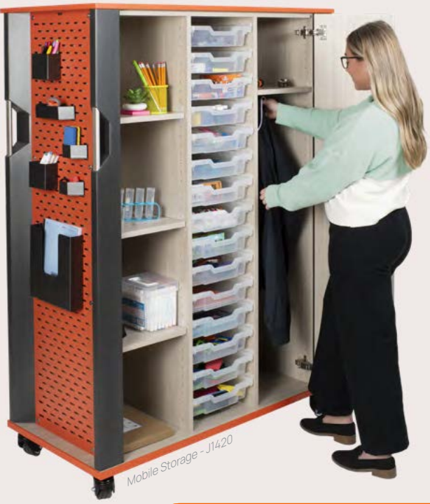
Mobile Storage - J1420

Enabling teachers to spend less time stressing about prepping the classroom and more time making an impact.