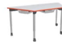
Trapezoid Multi-Purpose Table - MDT40 with Tote Drawer Storage