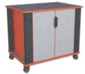
Mobile Storage - J0100 with Doors & Whiteboard Back Panel