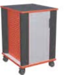
Mobile Storage - J0120 with Shelf Storage & Door