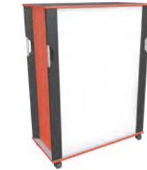
Mobile Storage - J1230 with Magnetic White Board

Seamlessly combined with these casework models: