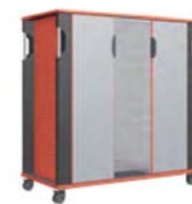
Mobile Storage - J1490 Tote Storage & Doors