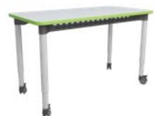
Multi-Purpose Table - MDT10 with Casters

Multi-functional SALTO elements used in this esports area: