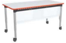
Multi-Purpose Table - MDT10 with Whiteboard Modesty Panel