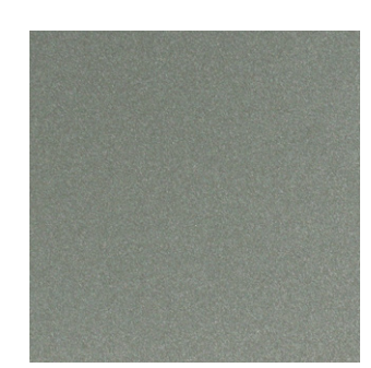
Pyrite 2525 YW207F