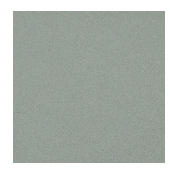
Gris 2150 Sablé YW365F