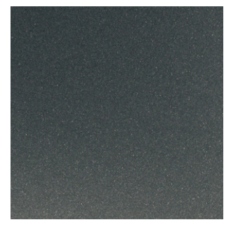
Canon 2525 YW279F