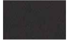
Black C35 Y2M36I