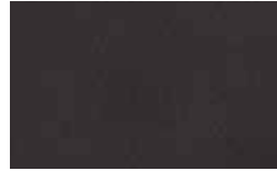
Dark Bronze C34 Y2M30I