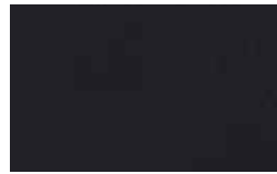
Black 05 Y2M33I