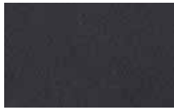
Dark Grey C38 Y2M32I