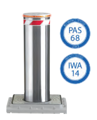
RB M30 900 (ex RB90S)