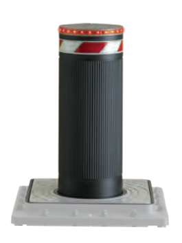
RB M30 700 (ex RB70S)