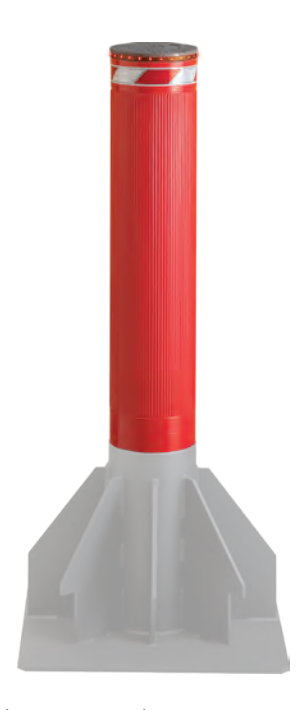
FB M50_1200 (ex FB120HS)