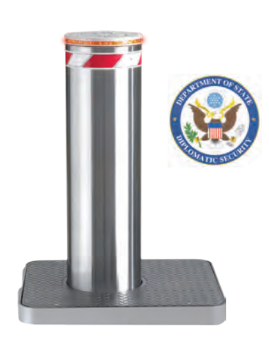
RB M50 900 (ex RB90HS)