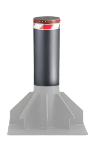
FB M30 _700

Impact resistance: 700.000 joules Height: 700 mm Width/Thickness: Ø 275/10 mm Unscrewable with counterframe