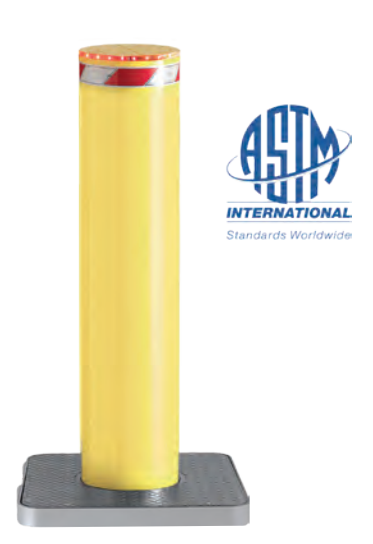
RB M30 1200