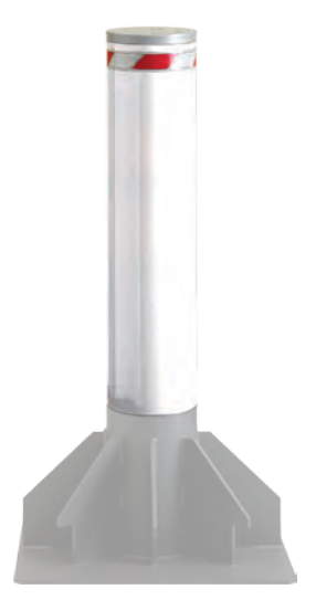
FB M50_900 (ex FB90HS)