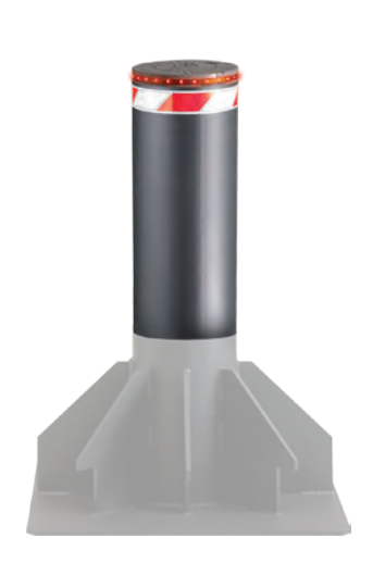
FB M30_900 (ex FB90S)

Impact resistance: 700.000 joules Height: 700 mm Shallow mounted Width/Thickness: Ø 275/10 mm Fixed into the ground