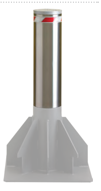
FB M30 _1200

Impact resistance: 700.000 joules Height: 900 mm Shallow mounted Width/Thickness: Ø 275/10 mm Fixed into the ground Also available as FB M40