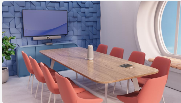
MEETING OWL 3 + OWL BAR

Wirelessly pair with the Owl Bar or a second Meeting Owl for collaboration in larger spaces