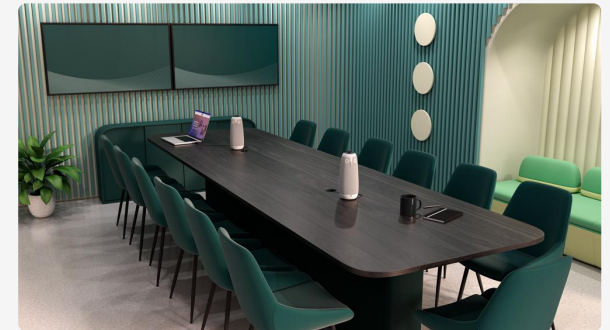
MEETING OWL 3 + MEETING OWL 3