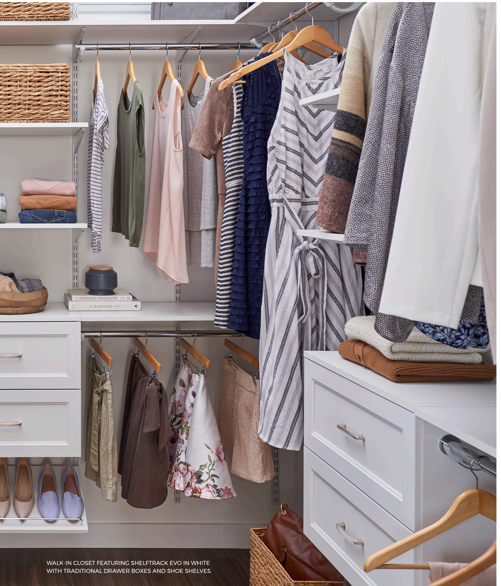
WALK-IN CLOSET FEATURING SHELFTRACK EVO IN WHITE WITH TRADITIONAL DRAWER BOXES AND SHOE SHELVES.