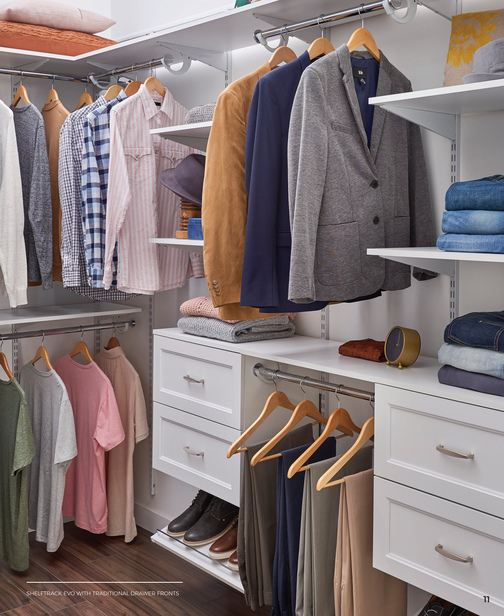
SHELFTRACK EVO WITH TRADITIONAL DRAWER FRONTS