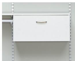
New drawer brackets allow for single standard Drawer Kit installations—which means extra savings on material costs