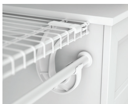
Existing ShelfTrack components are compatible with ShelfTrack Evo