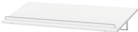
36" SHOE SHELF KIT (36") 35.5"W X 14"D SHOE SHELF (5/8")