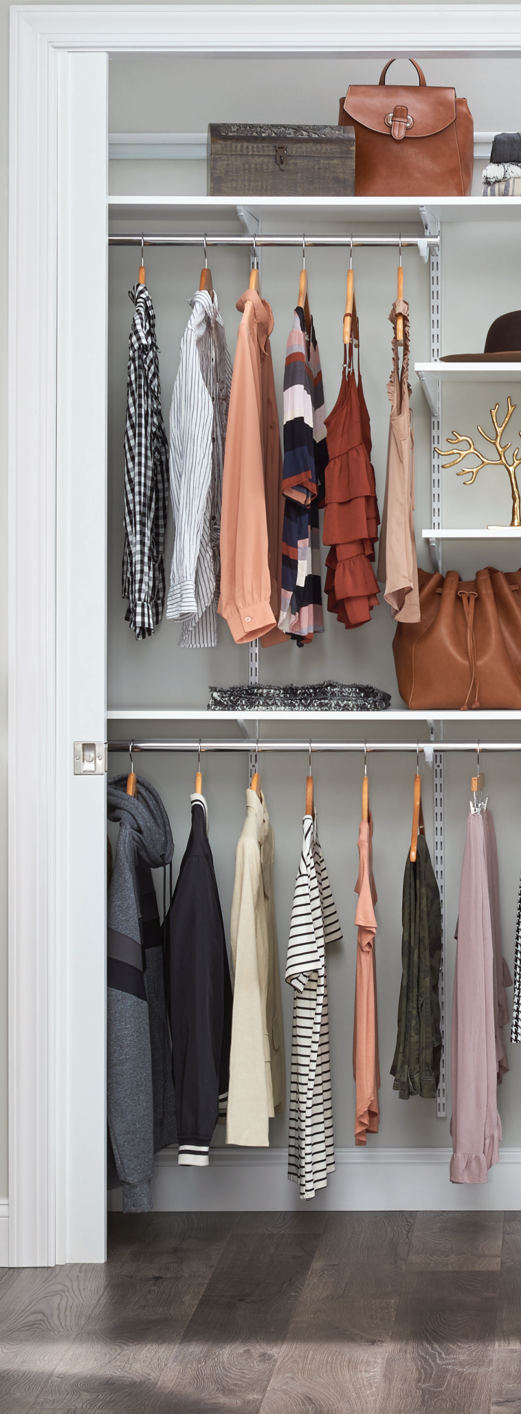
RIGHT: SHELFTRACK EVO IN WHITE