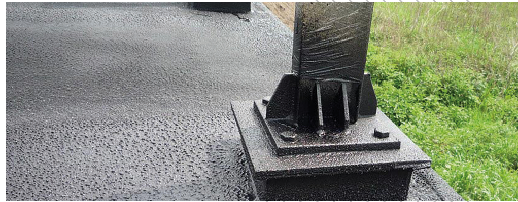
Oxibond 4020 Solvent based bitumen.

Waterproofing of block works or roofs over asphalt, concrete, and cement rendering.