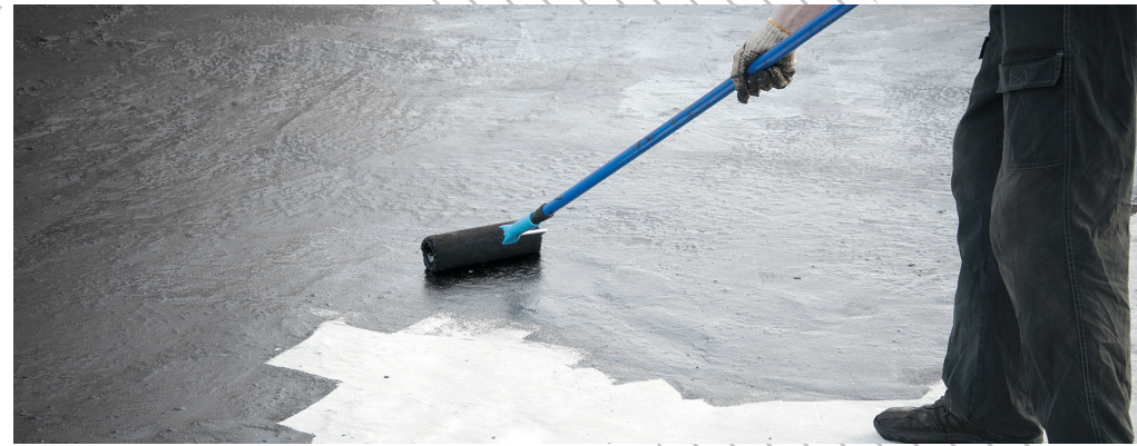
Oxibond 4015 Waterborne emulsified bitumen.