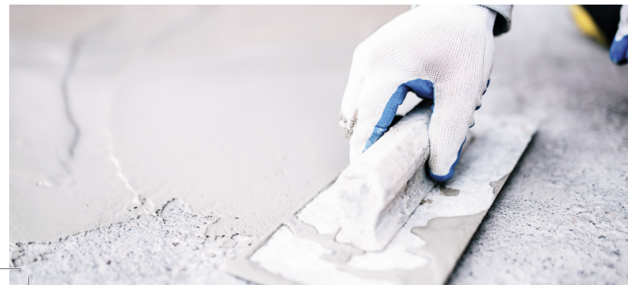
Cement Slurry Economical cement slurry for under-tiles, tanks and exposed areas.

To be mixed with cement plaster and powder putty.