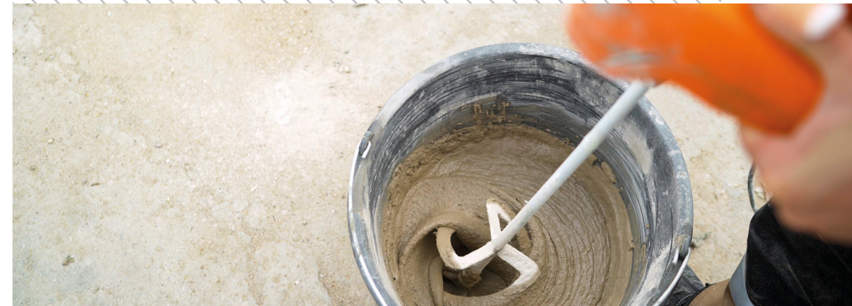
Oxibond 4004 Plastic cement additive.