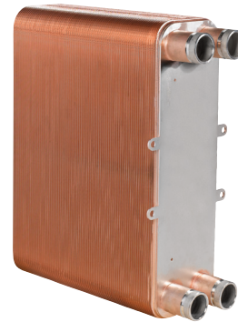
Double-Wall, Brazed Plate Heat Exchanger