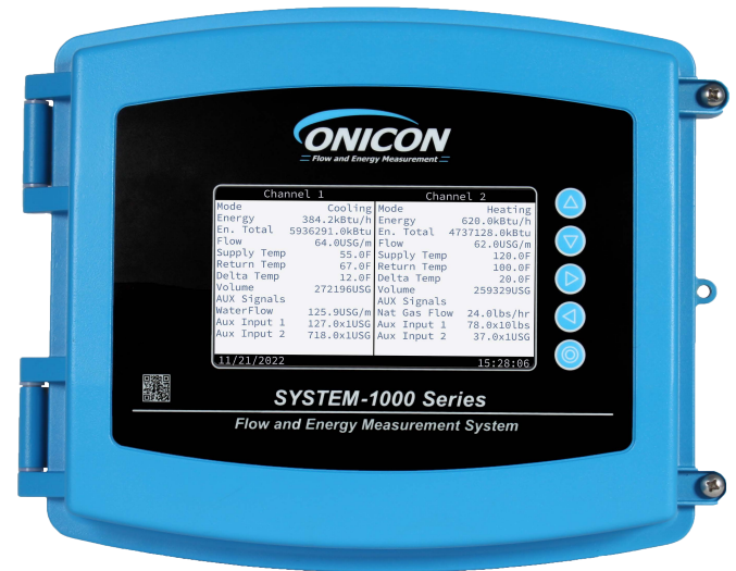
System-1000 Flow and Energy Measurement System

"By providing one communication output for multiple meters and reducing the number of connections, daisy chains, and network set up configurations, the System-1000 is a great solution for controls contractors who have to connect multiple devices to the network," says Luis Ojeda, Product Manager at ONICON. "Start-up for the System-1000 is a breeze. It is factory configured for all the connected devices and no PC or other interface is needed to configure network settings."