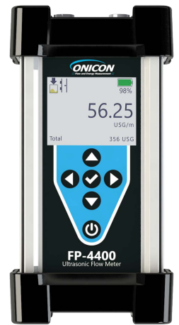
Handheld backlit display with 5-button interface

ONICON Incorporated has been manufacturing highly-accurate flow meters and energy measurement systems for chilled water, hot water, condenser water, steam and natural gas systems since 1987. For more information, visit www.onicon.com or e-mail sales@onicon.com .