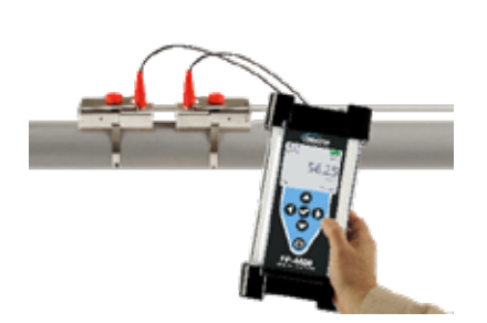
FP-4400 Portable Clamp-on Ultrasonic Flow Meter