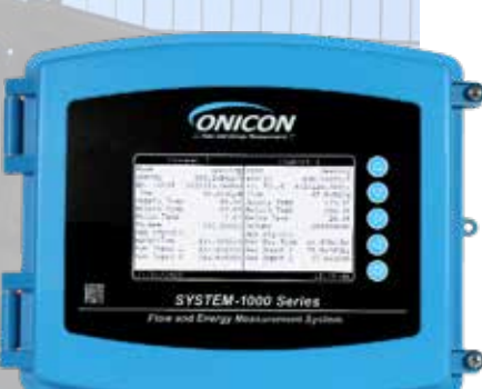
System-1000 Flow and Energy Measurement System

The System-1000 is a multi-input interface that provides a single network point for up to eight devices. Its innovative design allows dual channel energy measurement and is the ideal solution to accurately measure and report thermal energy usage, flow, temperatures, and efficiency.