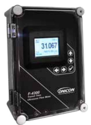
F-4300 Clamp-on Ultrasonic Thermal Energy Measurement System