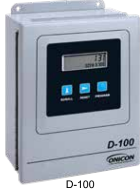
D-100 Display Module