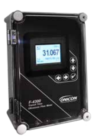
F-4300 Clamp-on Ultrasonic Flow Meter