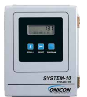
System-10 BTU Meter