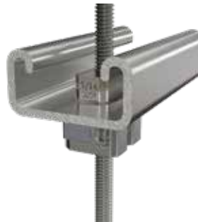
3. INSERT INTO STRUT