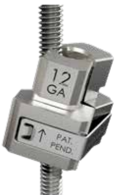
1. SNAP ONTO ROD