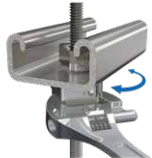
4. 1/4 TURN