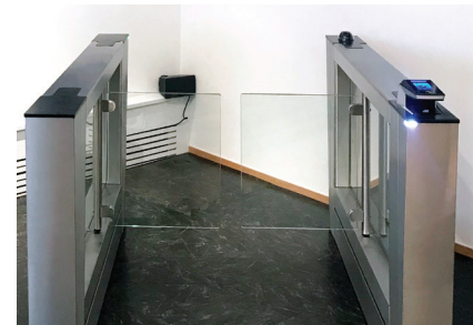
Shown (left to right): Fastlane Glassgate 200 with decorative glass accent; Fastlane Plus 400 MA with custom glass top; Fastlane Glassgate 155 with integrated MorphoWave™ reader and camera