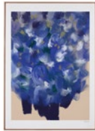
Flower bath Lisa Wirenfelt