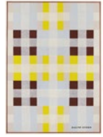
December Evelina Kroon