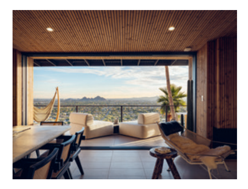
Stay Skyeview in Arizona by Cameron Custom and Camelot Homes.