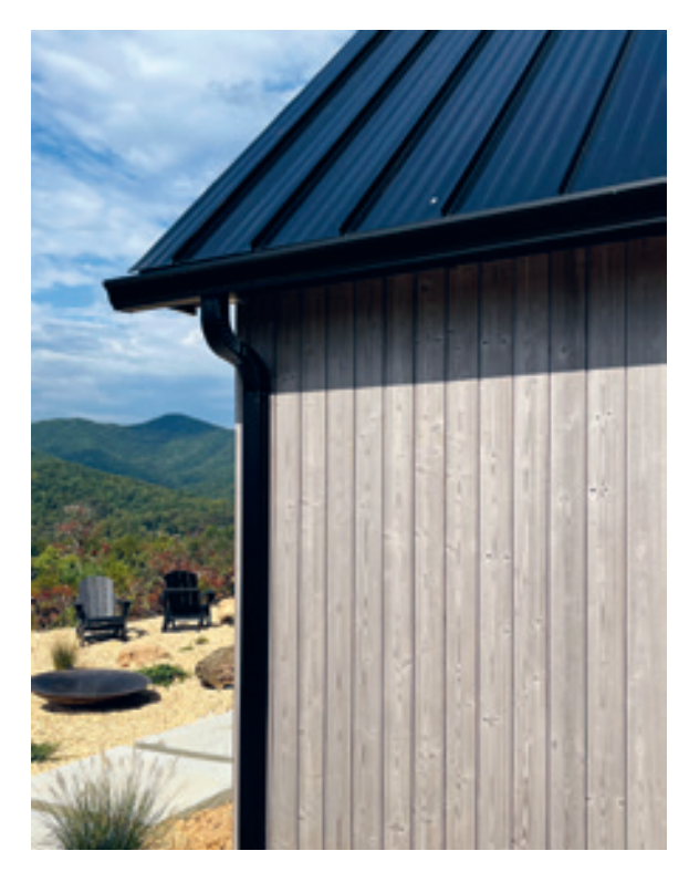
Luna Arctic Layer cladding, Black Fox Cabin by Nic Santos

When the goal is to achieve a uniform gray exterior cladding without delay, the pre-greyed Luna Arctic product range is an excellent solution. It provides an immediate gray finish that resembles naturally weathered wood – also highly suitable for interiors.