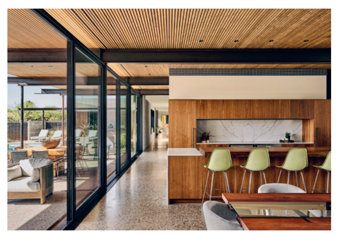
Cochise House, USA Architect: Identity Construction.