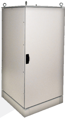
UL Type 12 and IP 55

RMR Industrial Enclosures are engineered to protect equipment with cutting-edge sealing technology, certified ingress protection ratings and multiple equipment mounting options to support IT equipment, automation electronics and electrical controls and instrumentation in any location.