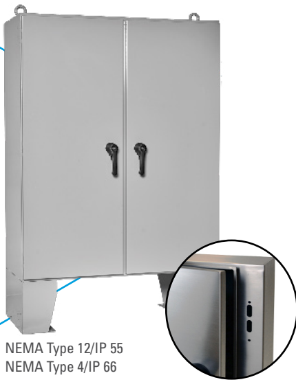
NEMA Type 12/IP 55 NEMA Type 4/IP 66