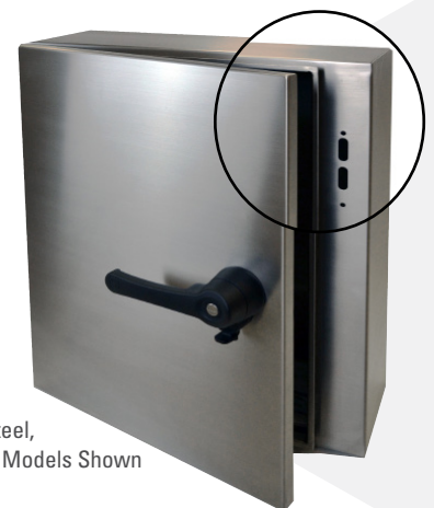
Stainless Steel, Disconnect Models Shown