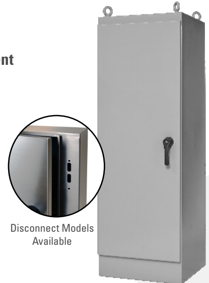
Disconnect Models Available