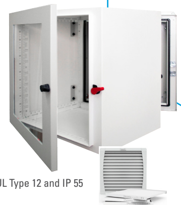
UL Type 12 and IP 55