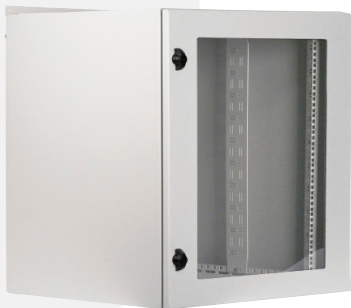
UL Type 12 and IP 55