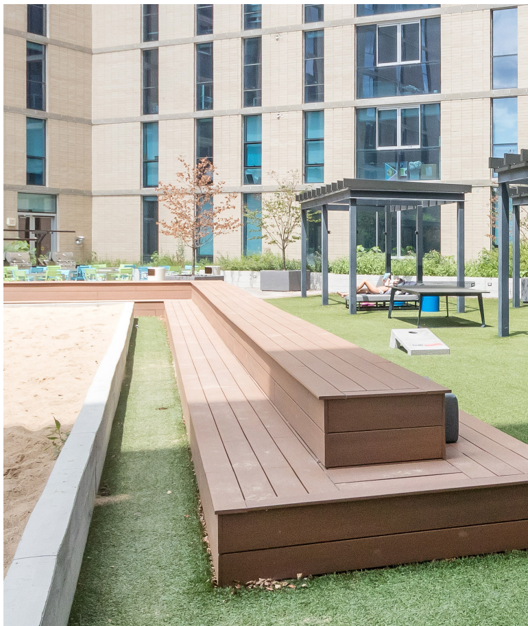
Hub Madison wraparound rooftop seating, featuring Fiberon Wildwood composite cladding in Tupelo from the Eden Collection.

“We’re actually working on a lot of exterior projects with Greystar, so I will definitely be specifying some Fiberon,” she said.