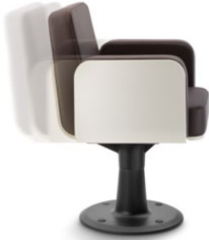
Woody RT 2312/S