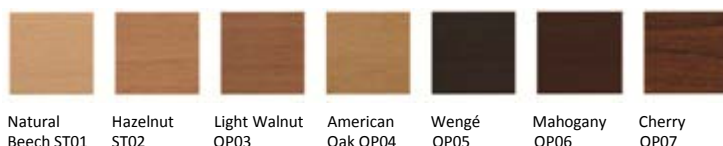
Natural Beech ST01 Hazelnut ST02 Light Walnut OP03 American Oak OP04 Wengé OP05 Mahogany OP06 Cherry OP07