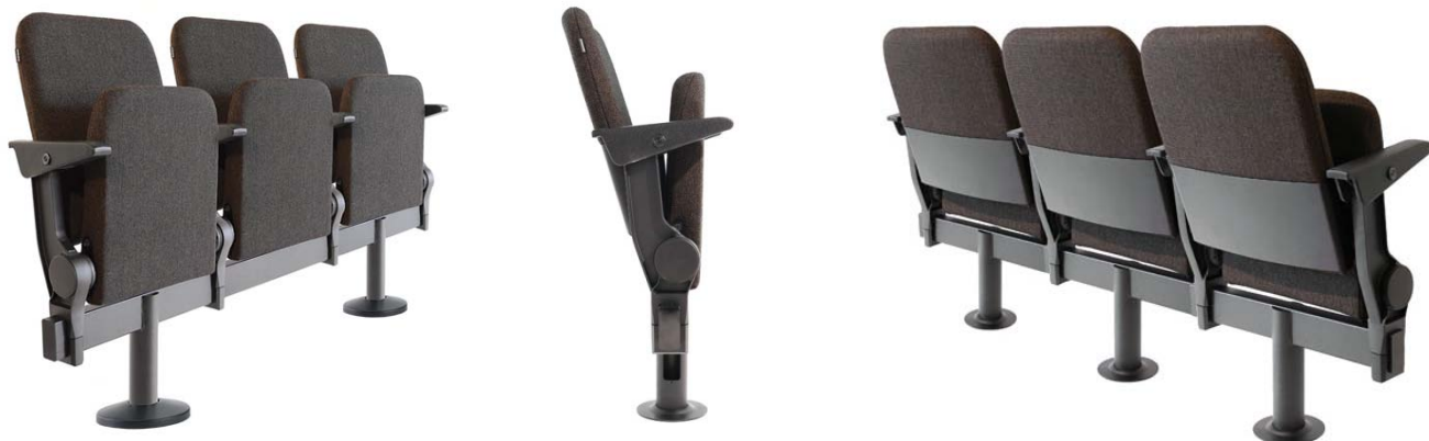
Minispace Fix 5067