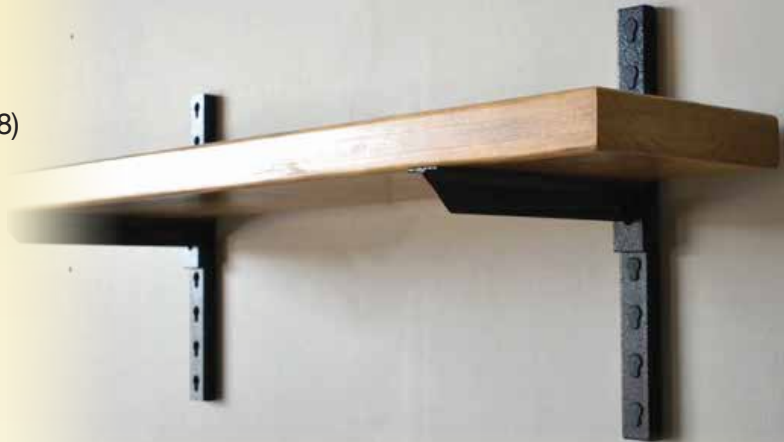
Left vertical arm without finishing plugs