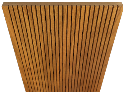
Dado™ 6/2 Panel