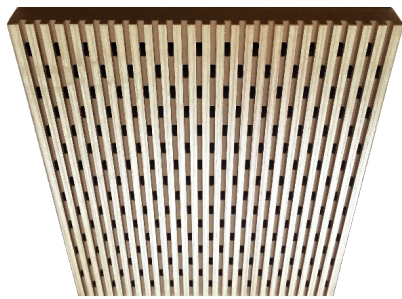
Dado™ 5/3 Panel