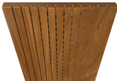
Dado™ 14/2 Panel