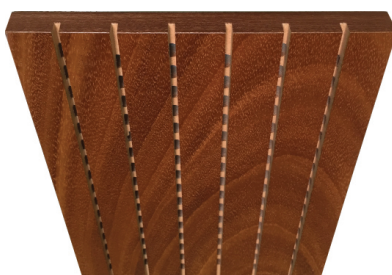
Dado™ 28/4 Panel