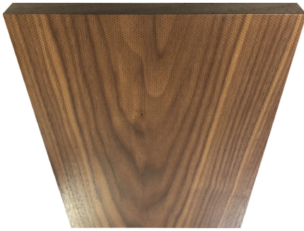
Perfecto® Micro Panel (Diagonal)