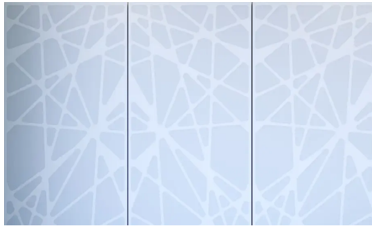
MOTIF - Web