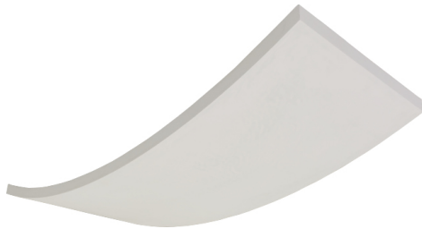
Waveform® Monoradial G