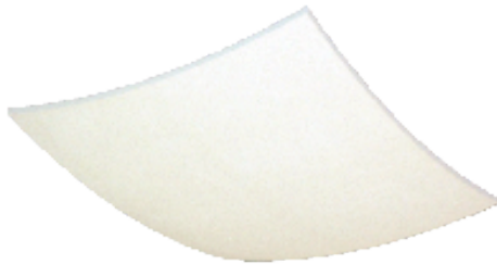
Waveform® Biradial G