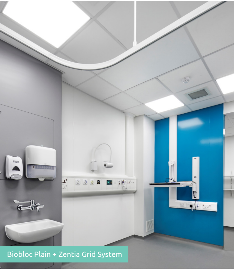
Biobloc Plain + Zentia Grid System