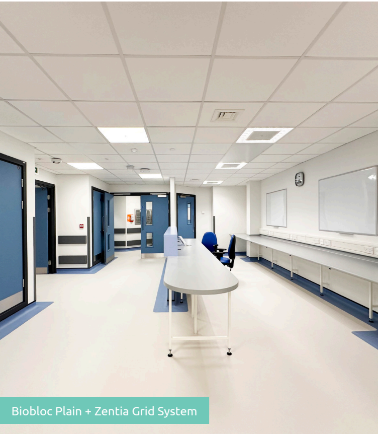
Biobloc Plain + Zentia Grid System