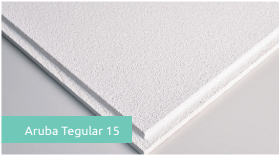
Aruba Tegular 15

Delivery Architects: WebbGray West Midlands Ambulance Service (WMAS)