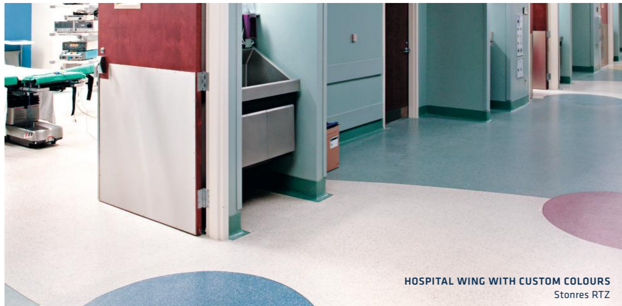
HOSPITAL WING WITH CUSTOM COLOURS Stonres RTZ