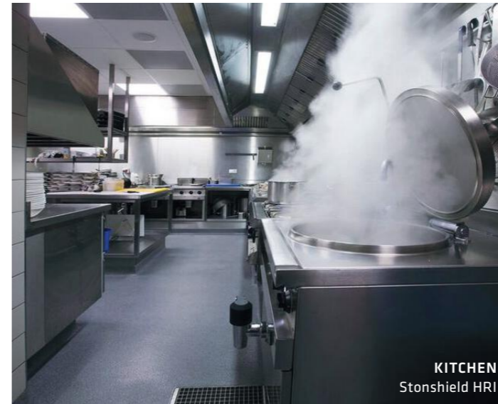
KITCHEN Stonshield HRI

INFLUENCING COLOUR - Palettes and design play a critical role in the right floor for the right environment and we can help guide you to the right system. Lighter coloured floors in operating rooms allow for quick spotting of any dropped objects during critical procedures. Planners can choose from bold to soothing colours, shades and tones, including custom designs, along with wayfinding patterns for easy identification of departments and areas.