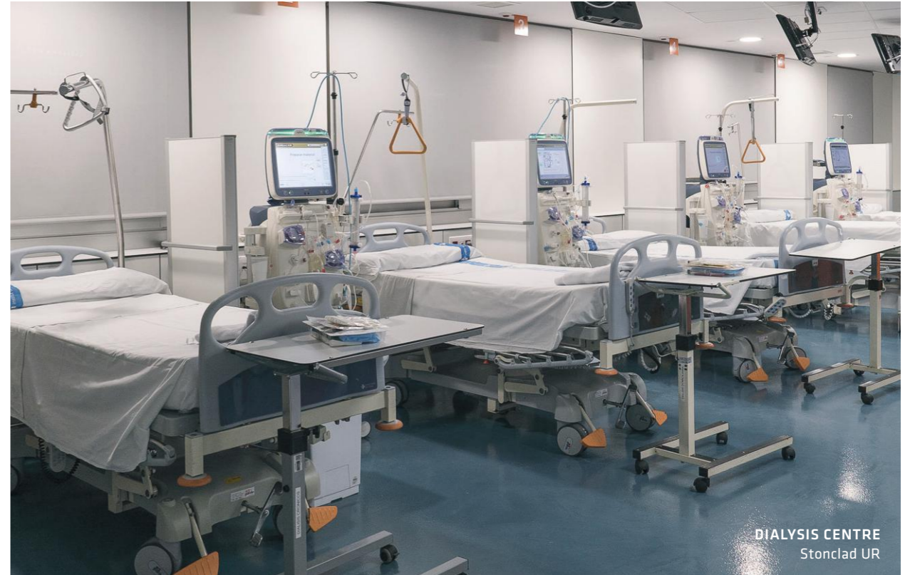
DIALYSIS CENTRE Stonclad UR