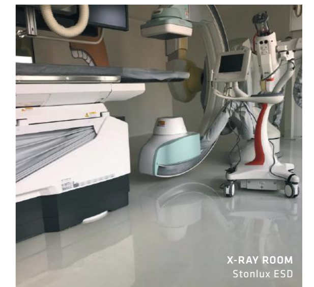
X-RAY ROOM Stonlux ESD

We understand that healthcare facilities never shut down. That is why we provide quick turnaround on installation, installing our floors when it works for you. This way you can manage your schedule with minimal loss of time and money. From communication to problem solving, Stonhard offers flexibility of service so we can get in and out within your tightest schedules with minimal disruption.