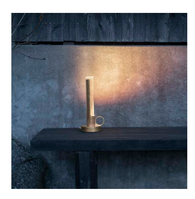
Visir by Pierre Sindre