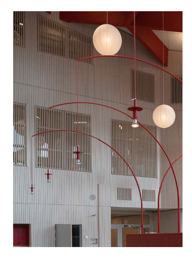
Vinge by Note Designstudio