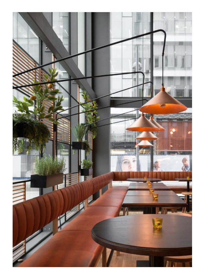
Custom lighting for hotel Carolina Tower