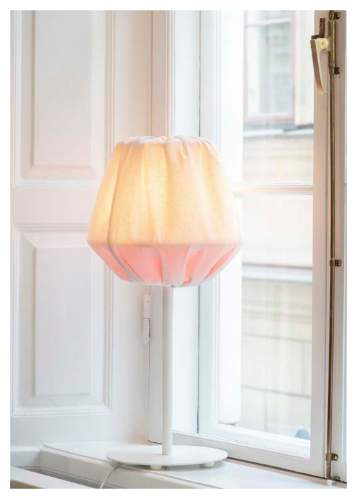
Baklava by Claesson Koivisto Rune