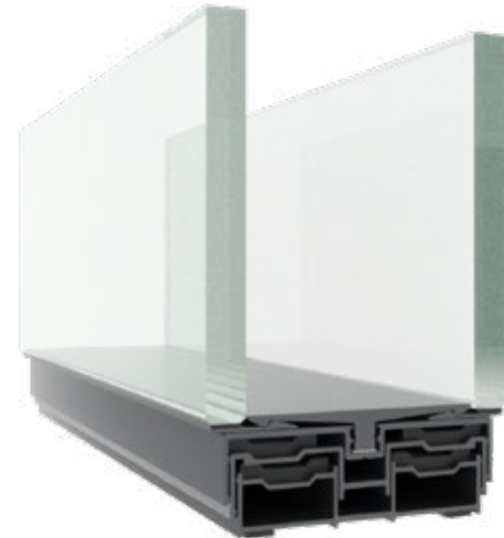
| Telescopic ground profile