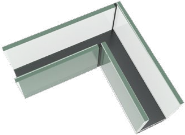
| Open glass corner joint