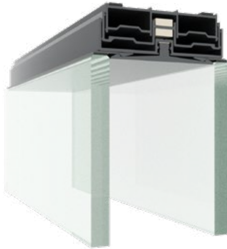
| Telescopic ceiling profile